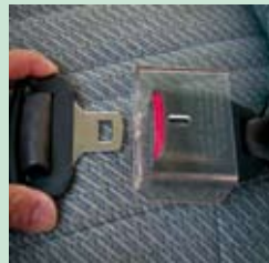
FAS Buckle Guard